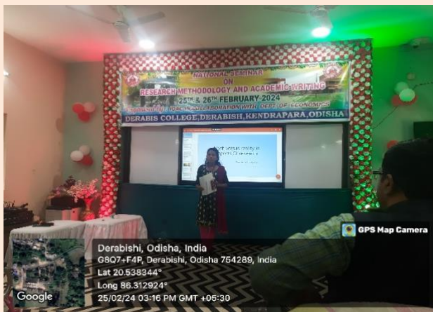
Derabishi, Odisha, India G8Q7+F4P, Derabishi, Odisha 754289, India Lat 20.538344° Long 86.312924° 25/02/24 03:16 PM GMT +05:30