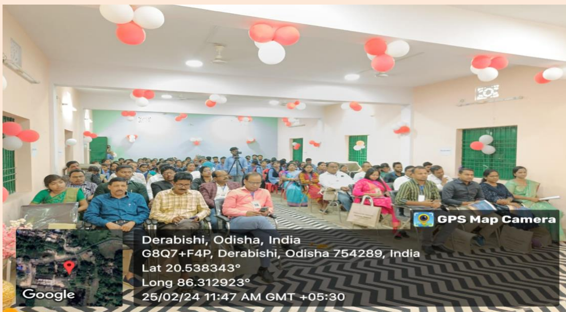
Derabishi, Odisha, India G8Q7+F4P, Derabishi, Odisha 754289, India Lat 20.538343° Long 86.312923° 25/02/24 11:47 AM GMT +05:30