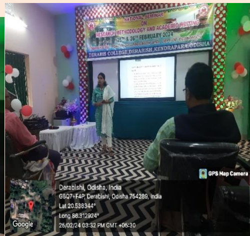
Derabishi, Odisha, India G8Q7+F4P, Derabishi, Odisha 754289, India Lat 20.538344° Long 86.312924° 25/02/24 03:32 PM GMT +05:30