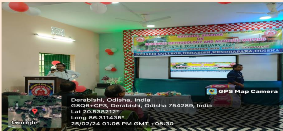
Derabishi, Odisha, India G8Q6+CP3, Derabishi, Odisha 754289, India Lat 20.538212° Long 86.311435° 25/02/24 01:06 PM GMT +05:30